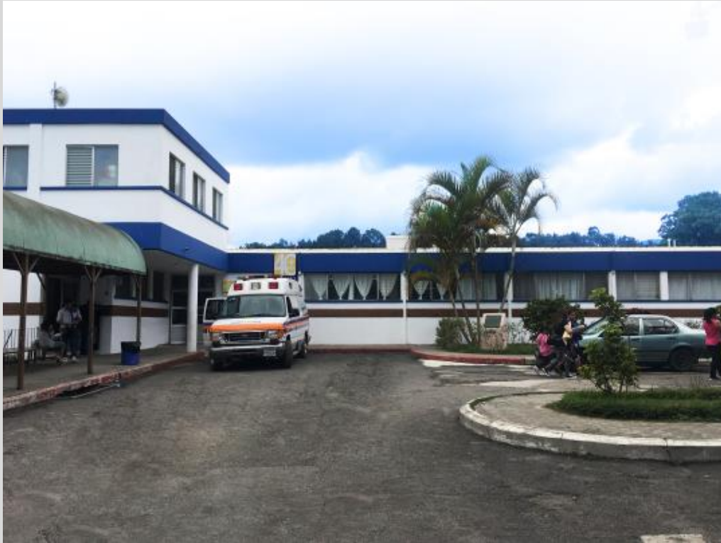
Juan Pablo 2 Maternity and Infant Hospital